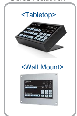
Control Pad - Default Selection